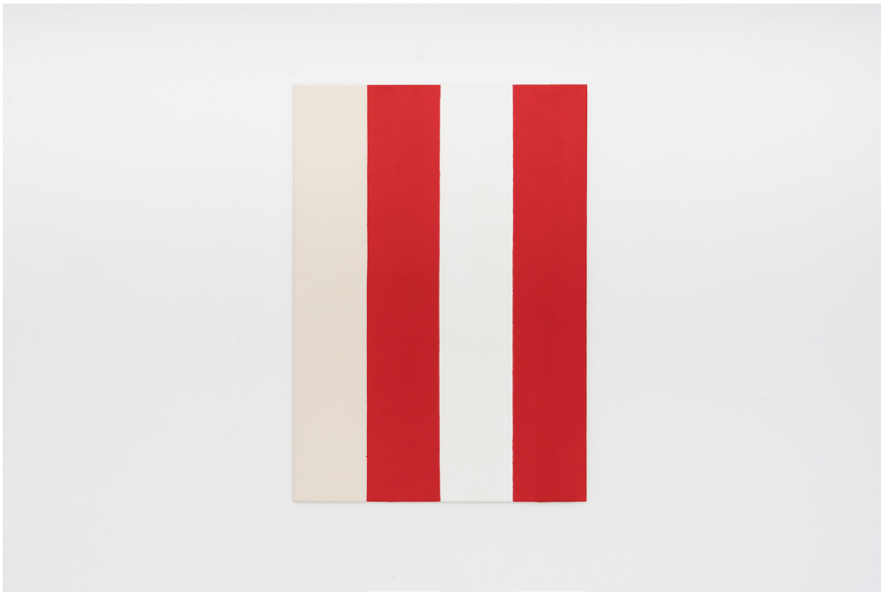
Thilo Brendel & Michel Büchsenmann Stripe Painting, 2025

acrylic on canvas 100 x 70 cm 39.4 x 27.6 in