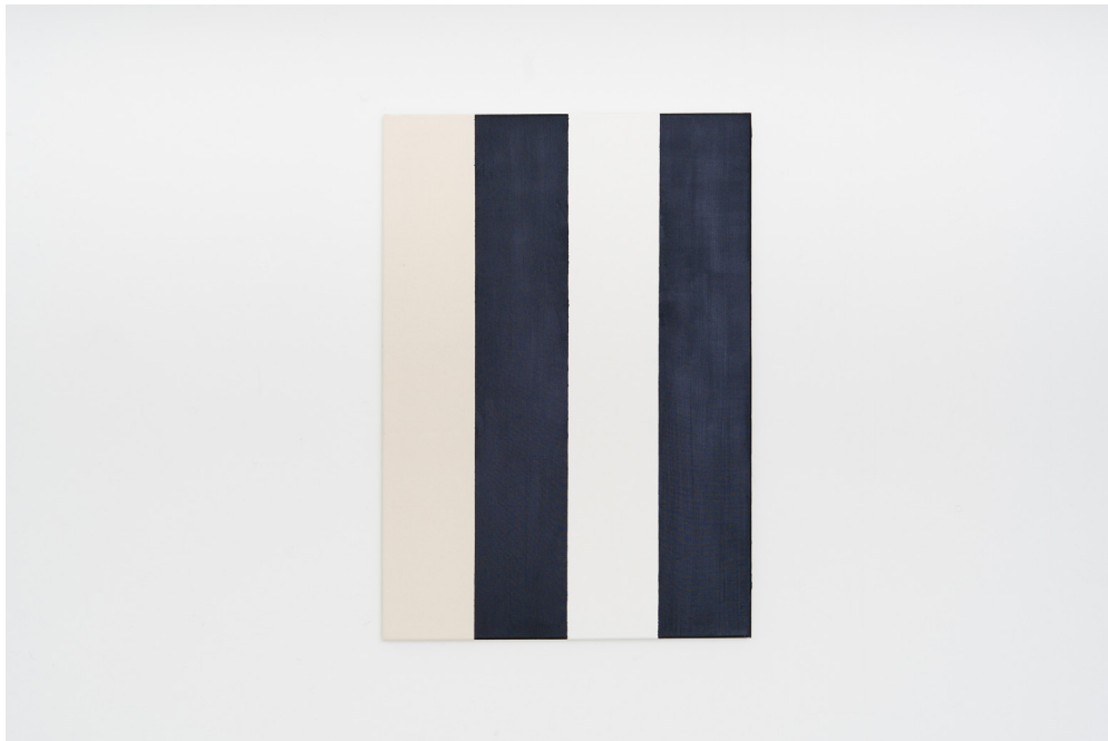
Thilo Brendel & Michel Büchsenmann Stripe Painting, 2025

acrylic on canvas 100 x 70 cm 39.4 x 27.6 in