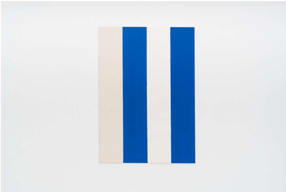
Thilo Brendel & Michel Büchsenmann Stripe Painting, 2025

acrylic on canvas 100 x 70 cm 39.4 x 27.6 in