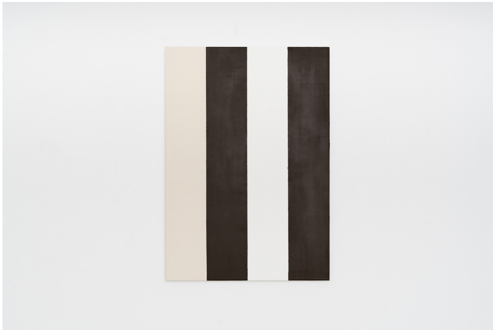
Thilo Brendel & Michel Büchsenmann Stripe Painting, 2025

acrylic on canvas 100 x 70 cm 39.4 x 27.6 in