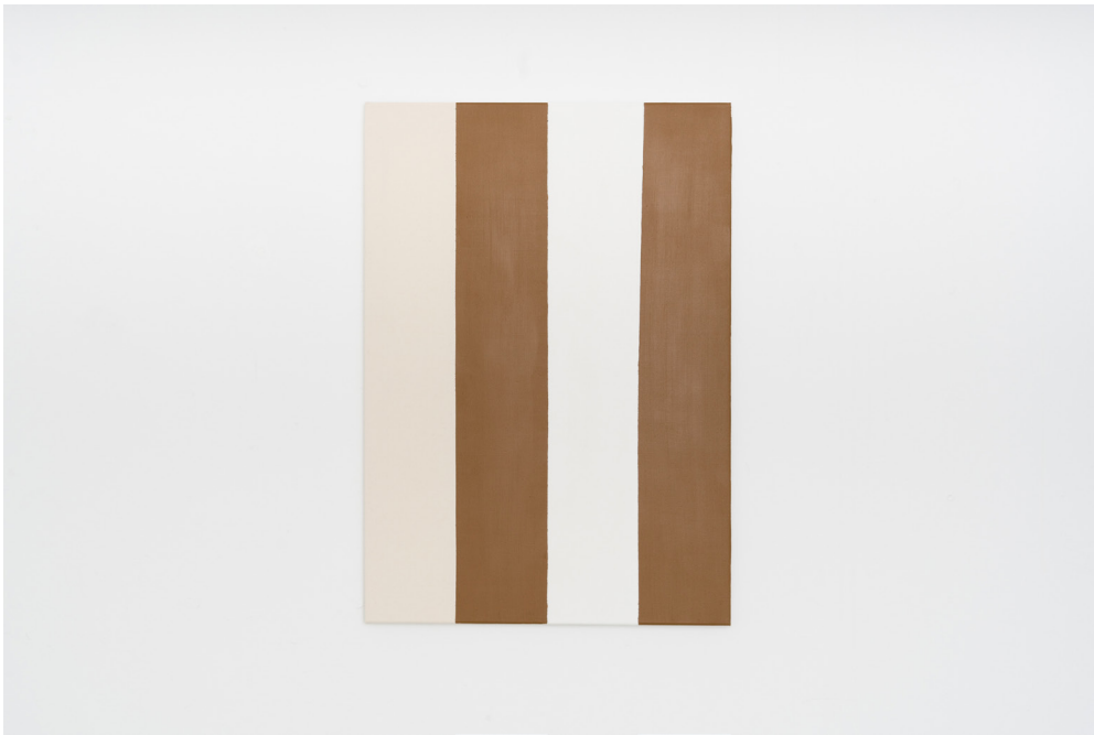
Thilo Brendel & Michel Büchsenmann Stripe Painting, 2025

acrylic on canvas 100 x 70 cm 39.4 x 27.6 in