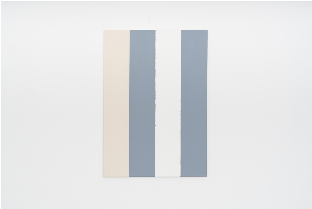
Thilo Brendel & Michel Büchsenmann Stripe Painting, 2025

acrylic on canvas 100 x 70 cm 39.4 x 27.6 in