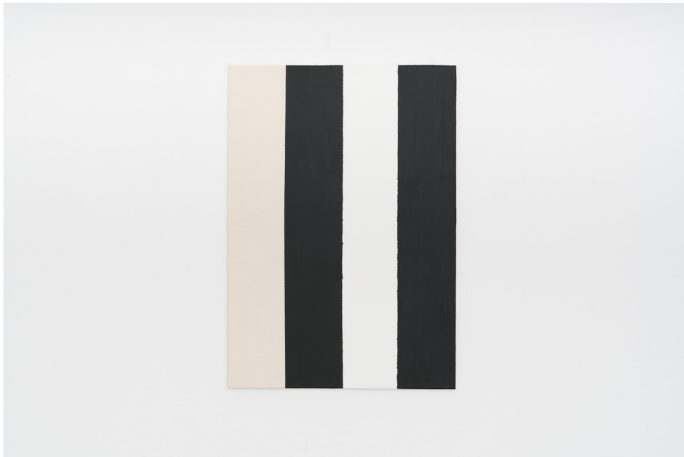
Thilo Brendel & Michel Büchsenmann Stripe Painting, 2025

acrylic on canvas 100 x 70 cm 39.4 x 27.6 in